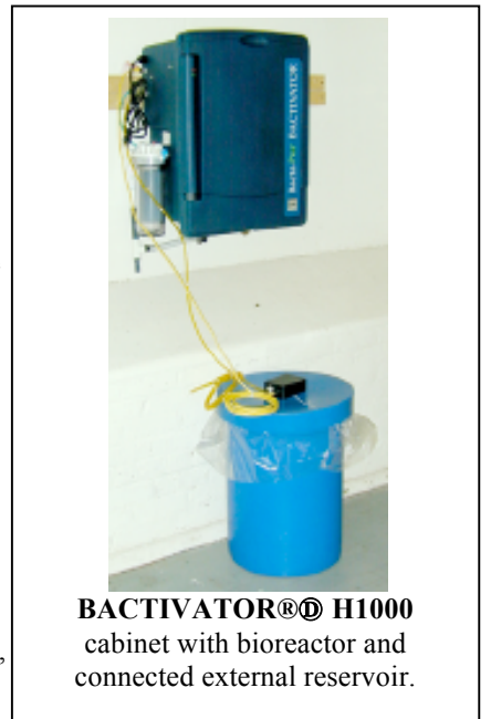
BACTIVATOR® H1000 cabinet with bioreactor and connected external reservoir.