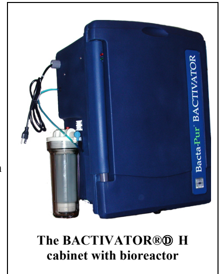
The BACTIVATOR® H cabinet with bioreactor

The BACTIVATOR® H series requires the Bacta-Pur® H-KIT for operation. Each KIT contains the correct ratios of Bacta-Pur® H2000 and Bacta-Pur® PRECONDITIONER. Starting after twelve months of operation, the units require one annual replacement parts kit per year.